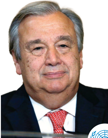
ANTONIO GUTERRES SECRETARY-GENERAL UNITED NATIONS